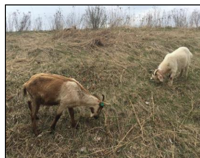
Goats were on display at the April 13 Open House showing how they like to chew buckthorn and other invasive plants.

The Board of Commissioners is expected to consider adoption of the Plan at their May 9 Physical Development Committee meeting.