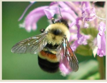
Rusty Patched Bumblebee

Native to Minnesota, Rusty-patched Bumble Bees ( Bombus affinis ) are identifiable by a rust colored patch on their back, on the second segment of their abdomen.