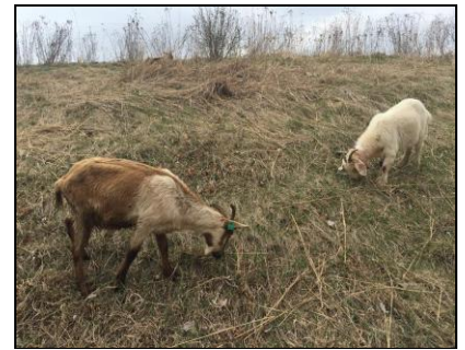
Goats were on display at the April 13 Open House showing how they like to chew buckthorn and other invasive plants.

The Board of Commissioners is expected to consider adoption of the Plan at their May 9 Physical Development Committee meeting.